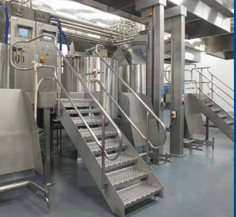
cook-chill the key to extended shelf life